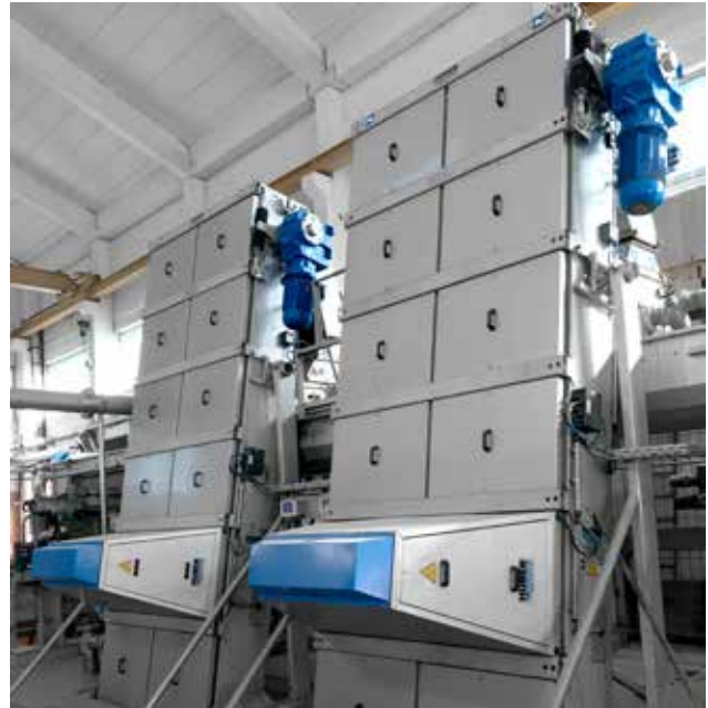
Two HUBER Multi-Rake Bar Screen RakeMax® units equipped with the HUBER Detection System Safety Vision. By detecting critical screenings, Safety Vision prevents damage to the screen and downstream machinery.