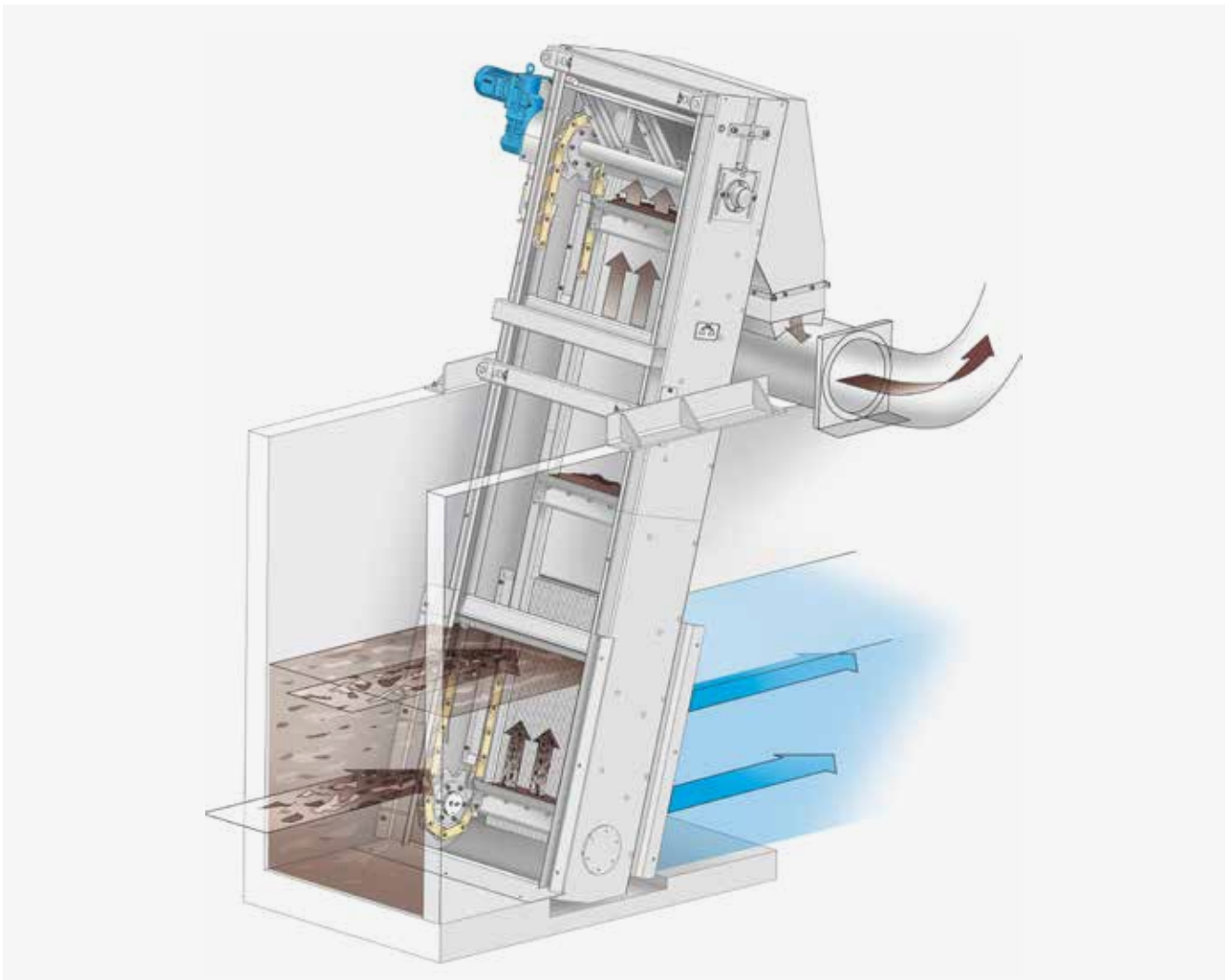
Schematic drawing of the HUBER Multi-Rake Bar Screen RakeMax®.

The RakeMax® J screen is a modified version of the proven HUBER RakeMax® screen. In contrast to the standard RakeMax® design version, the RakeMax® J screen does not have straight bars, the screen bars are bent in the bottom section, i.e. curved towards the sewer base. It is also this special form of the screen bars which gives the screen its name as the letter 'J' has approximately the same shape as the curved screen bars. The screen rake moves along the curvature of the screen bars and describes a segment of a circle in this section. The flat inclination angle of the screen bars in the sewer base section increases the cross-sectional flow area of the screen with the result of reduced hydraulic losses and a reduced flow velocity in the gaps between the screen bars.