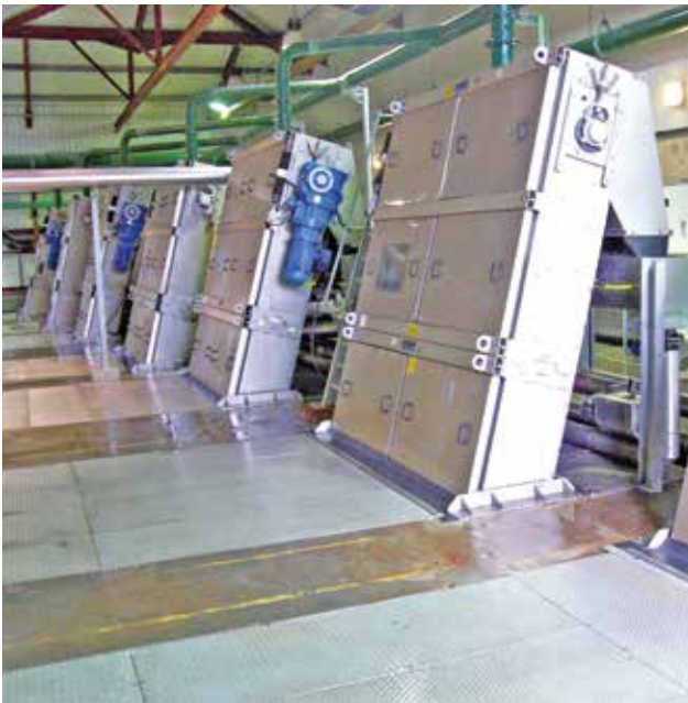
Universally applicable HUBER RakeMax® screen for big channel widths and big discharge heights.