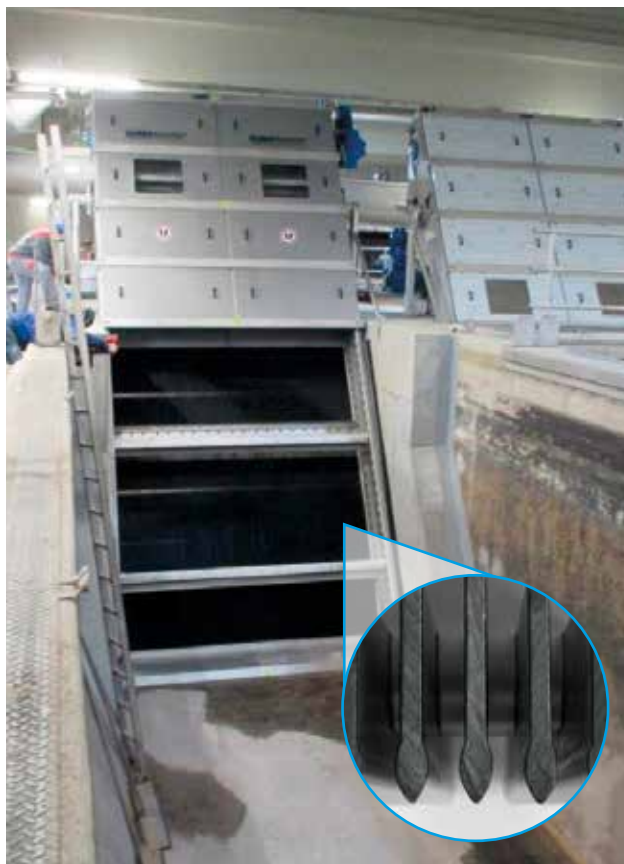
Multi-Rake Bar Screen RakeMax® Hybrid with the proven flow-optimising tear-drop shaped bars – here installed at the grit trap outlet.

Another advantage of the RakeMax® Hybrid screen are the individually replaceable screen bars for quick and safe handling without the need for welding work.